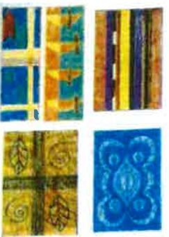
Adinkra and Kente Cloth Designs Artist: Sandy Leland Crayole fabric markers, cloth 12" x 18" Private Collection