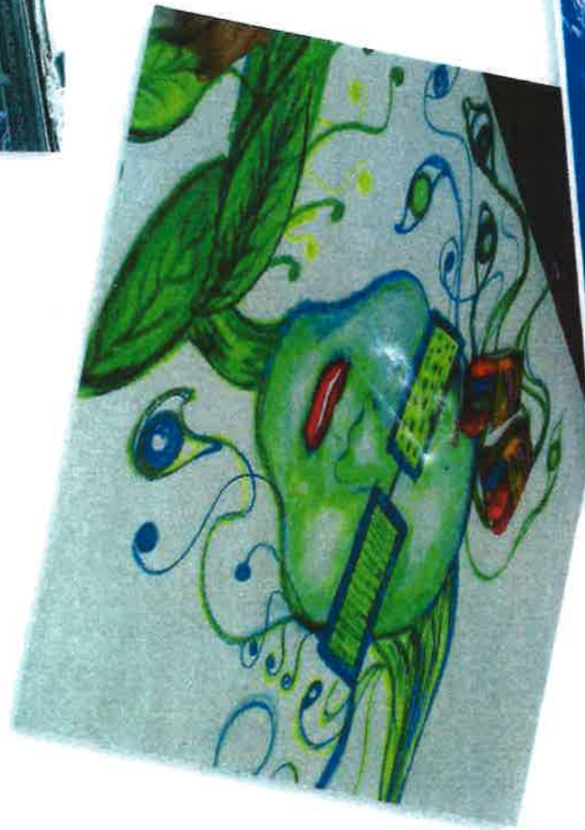
Artwork by student from Chicago Public Schools

Banners can be represented by flags. Many cultures include flags in ceremonies. Flags and banner drapery often include colors that hold specific meaning.